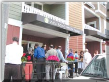
After Hours - Network and relax with other Chamber members.

Currently bi-monthly See weekly update for details.